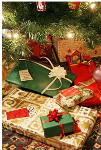
Deciding where to spend the holidays can cause stress to a family.

It's supposed to be the most wonderful time of the year, but tensions over how to split your time up between all the grandparents during the holidays can add an extra dose of crazy to an already hectic season.