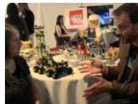
5343 Ohjz Wr |v Uhyzuz