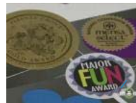
Vhdwfwkh P xvwKdyh Krögd| Wr |v