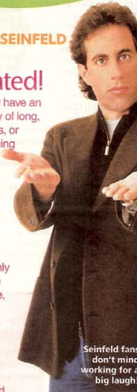
Seinfeld fans don't mind working for a big laugh!