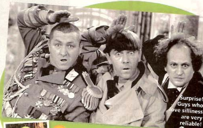
Surprise! Guys who love silliness are very reliable!